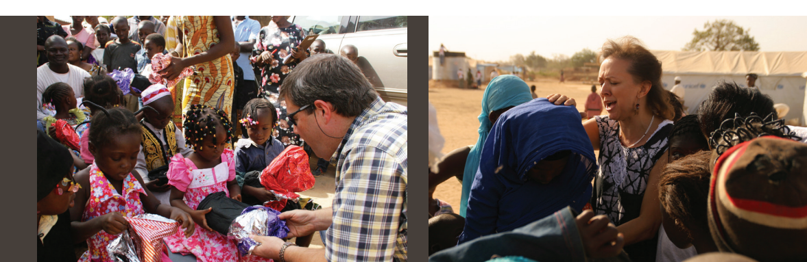
"Trust in the Lord with all your heart, and do not lean on your own understanding." Proverbs 3:5 Esv

Support a missionary with prayer and monthly support so that many laborers may be sent into the harvest fields.