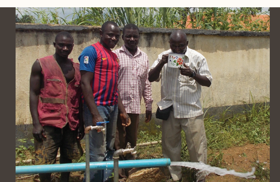
"Thus says the Lord, 'I have purified these waters; there shall not be from there death or unfruitfulness any longer." 2 Kings 2:21 NASB

This Motorized Borehole is a practical way of showing God's love and care to humanity. It has inspired and motivated the members of this community to love one another and be united more than ever before. The joy of this people and village knows no bound, more so that they are directly involved in the day-to-day management of it.