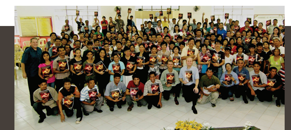
"For in it the righteousness of God is revealed from faith to faith; as it is written, 'But the righteous man shall live by faith."" Romans 1:17 NASB

Pray for national churches to catch the vision of partaking in the Great Commission mandate. Ask the Father for provision and for vision to ignite national churches to send laborers into the harvest.